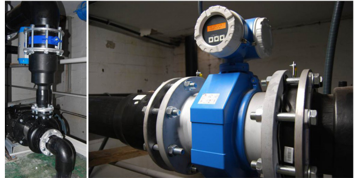
The flowmeter used at the DWTP in Sant Joan Despí, Barcelona.

The equipment has been installed 6 months earlier than expected because AB has high interest in having a long period of recharge. The system will be in operation for a minimum of one year, as effects in groundwater can appear at mid-term. The equipment allows the testing of the injection of sand water independently on the needs for groundwater of the DWTP, as the rest of the dual wells (injection-extraction) will be fully operative during the demonstration phase.