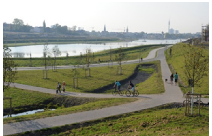
Lake Phoenix, in a present view, Emscher.

cally revitalized until 2020 to complete the Emscher re-conversion project. Until now, 264 km of sewers and 91 CSOs with a volume of 328.000 m 3 have been constructed. 120 km of water courses are already restored. Some ecological hotspots have already been completed, such as Lake Phoenix which was built on an area where a steel plant was formerly located; now it comprises biodiversity, recreation, flood retention, and attractiveness enhancement in the middle of the city of Dortmund.